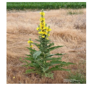
Common Mullein -Stage Two