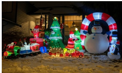
Frosty's Recognition (Inflatables)