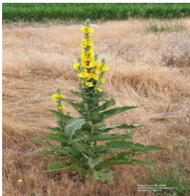
Common Mullein – Stage Two