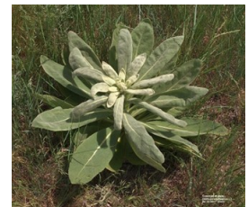
Common Mullein – Stage One